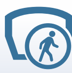
OPTIONAL Hose reel