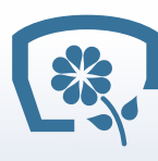
OPTIONAL Summer/garden use