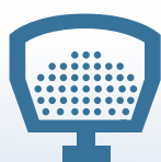
STANDARD Salt & sand

The hopper construction can easily be transformed into a complete brine solution sprayer or into a pre-wet combi spreader that moistens the spreading material. Integrated tanks in the double-walled hopper body holds up to 450 l of liquid. The spreader can optionally be equipped with a 2 meter spray bar or a hose reel with hand-held spray nozzle.