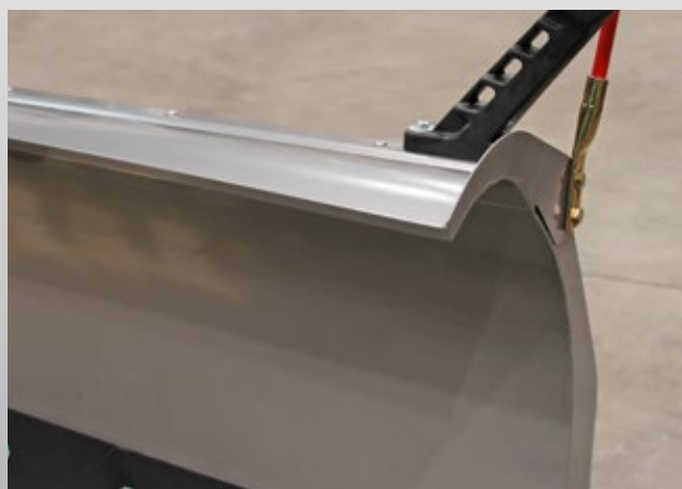
Optional snow deflector in steel (straight-blade)