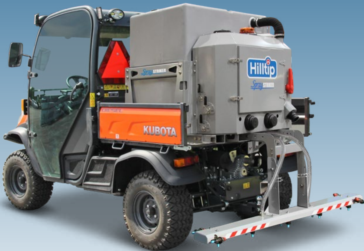
SprayStriker™ 500 on Kubota utility vehicle