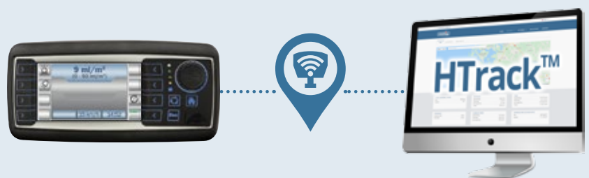
The optional HTrack™ program transfers spreading data via mobile network

Track and manage all of your spreaders, sprayers and snowplows online on your computer, tablet or smartphone. The program shows treatment route on map, and spreading details like speed, GPS location, material used etc. With HTrack™ you can keep track of your expenses and get de-icing performance evidence for slip and fall injury claims. The spreading data can be summarized and generated as PDF reports.