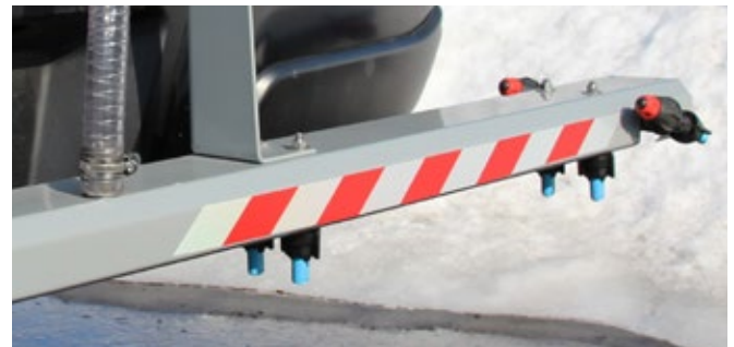
Double spray nozzles for de-icing even in high speeds